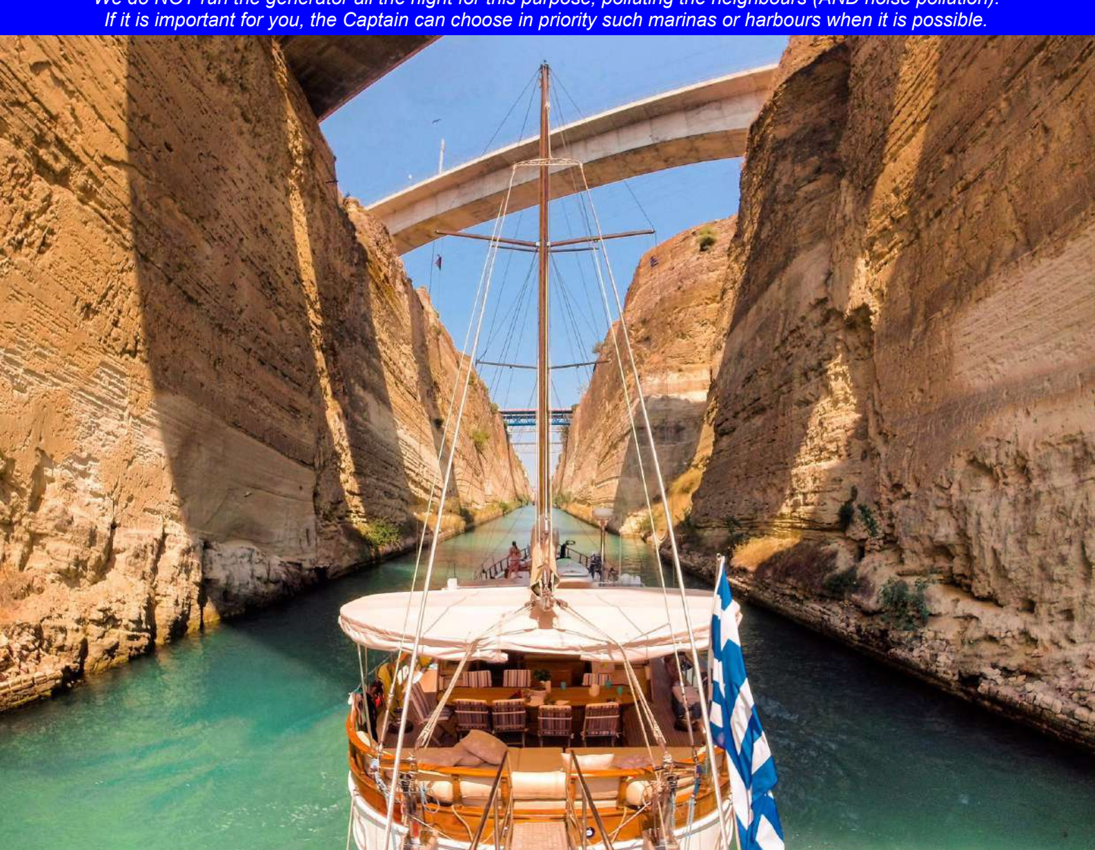
Crossing the Corinth chenal during the “7 Wonders Odyssey”

If it is important for you, the Captain can choose in priority such marinas or harbours when it is possible.