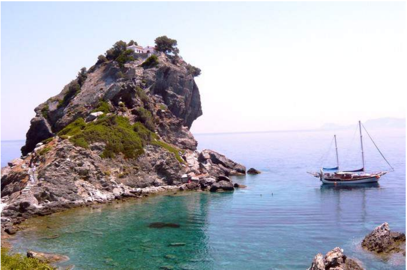
ANATOLIE on anchor under "Mamma mia" Church